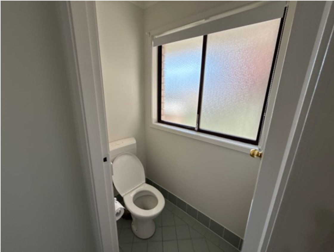
The common toilet tested, functioned at the time of inspection.