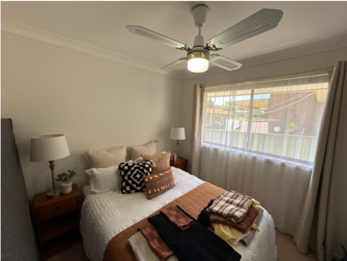
Interior bedroom areas present in satisfactory condition for the age.