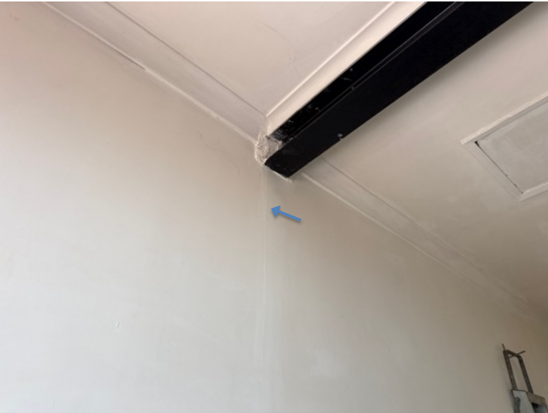
Plasterboard painting is patchy and sections display hairline cracking (garage area example above).