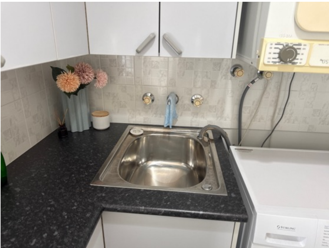
Water pressure tested, is sufficient.