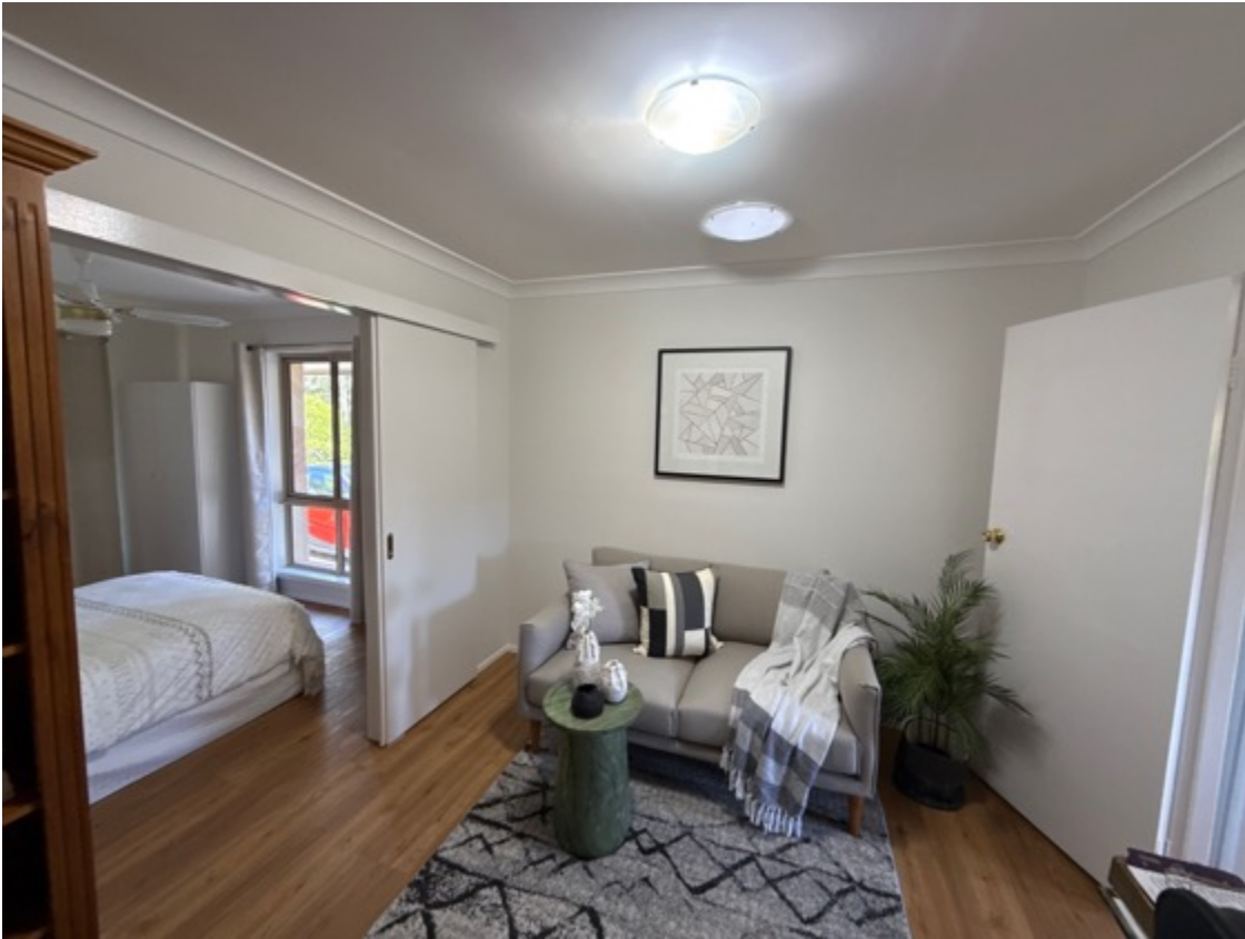
Example living area above.