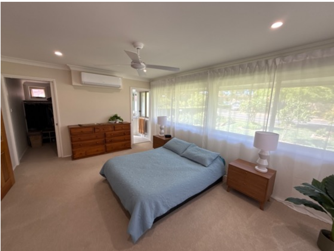
The main bedroom area presents in satisfactory condition for the age.