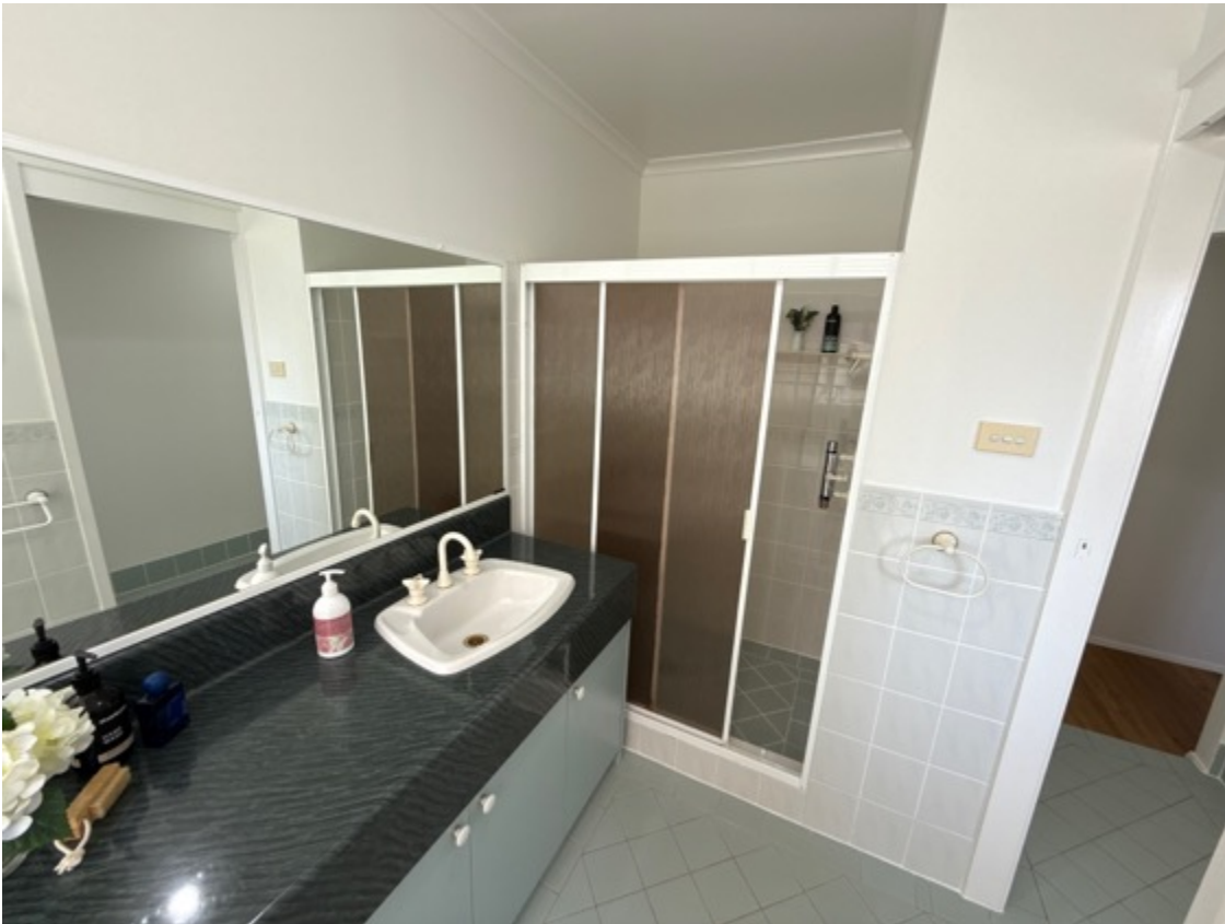
Hot and cold water services tested, functioned at the time of inspection.