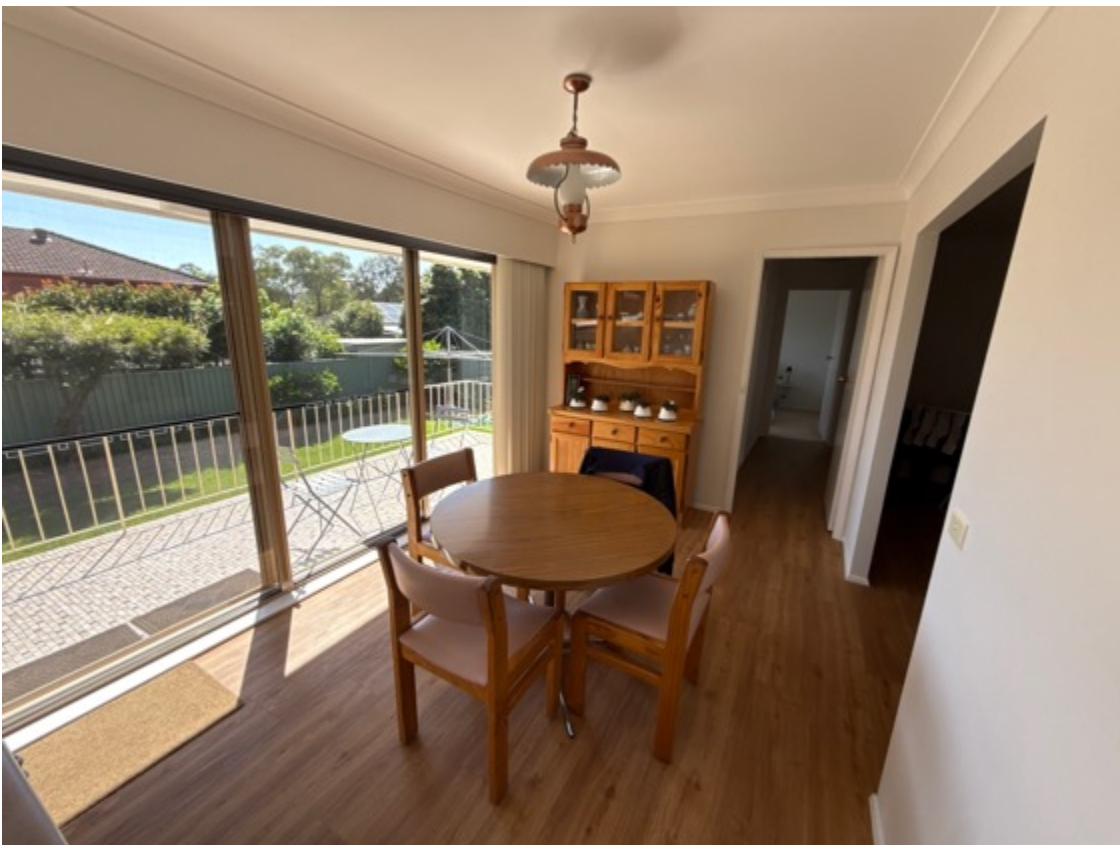
Internal surfaces have sufficient paint coverage, recently completed.