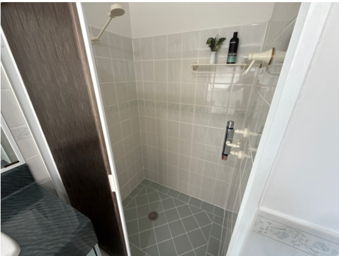
Water pressure tested, is sufficient.