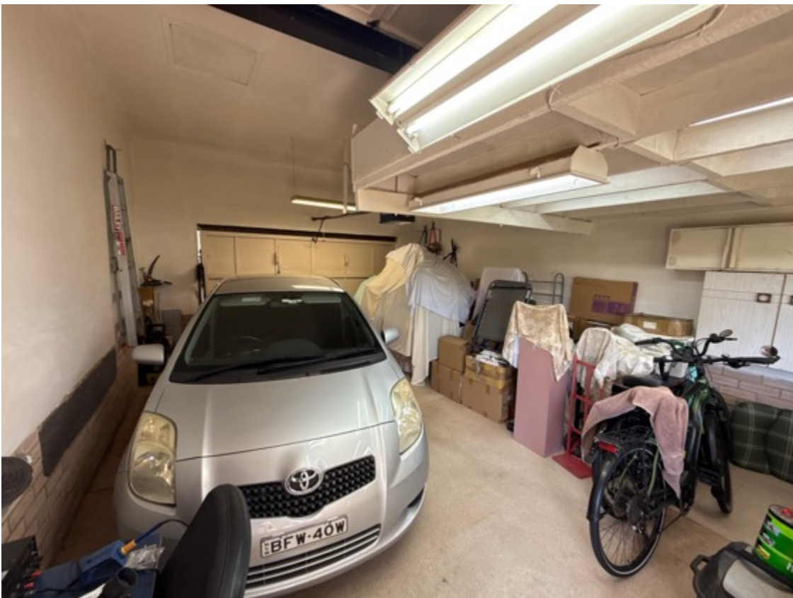
The garage area is in serviceable condition.