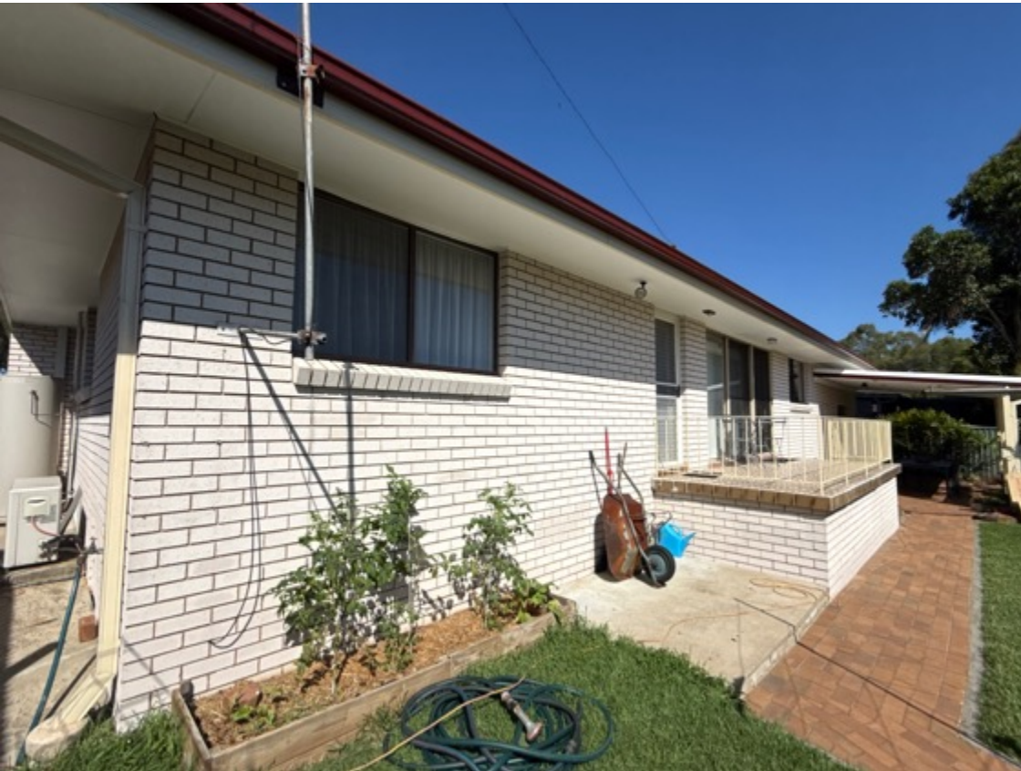
Rear elevation example above.