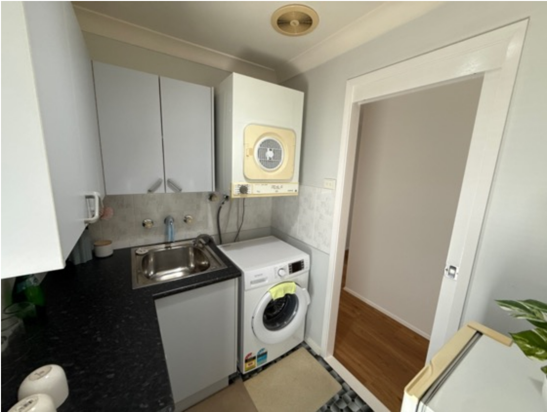
The laundry is in serviceable condition.