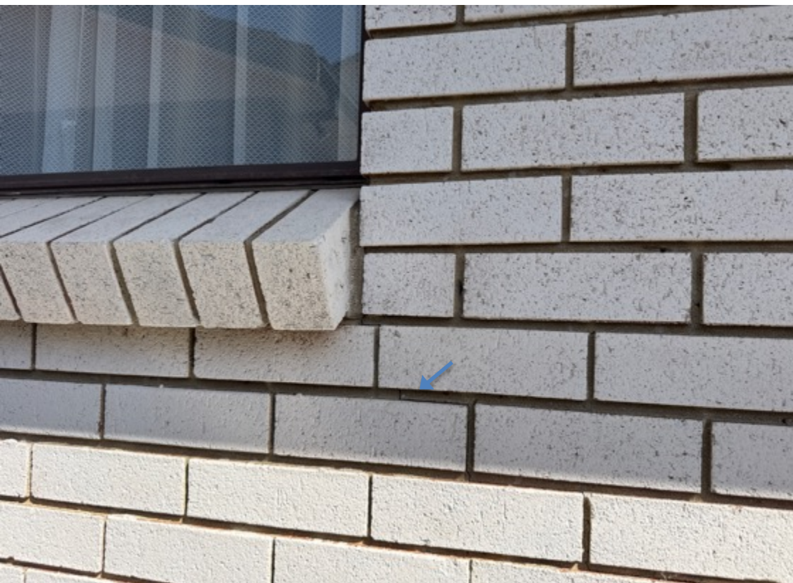
Isolated sections of exterior brickwork displays category one hairline cracking (rear right side elevation below the window sill example above.)