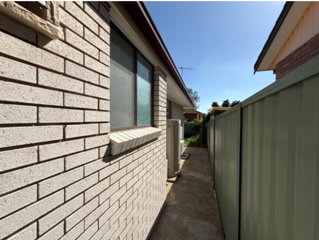
Exterior windows and doors present in satisfactory condition for the age.