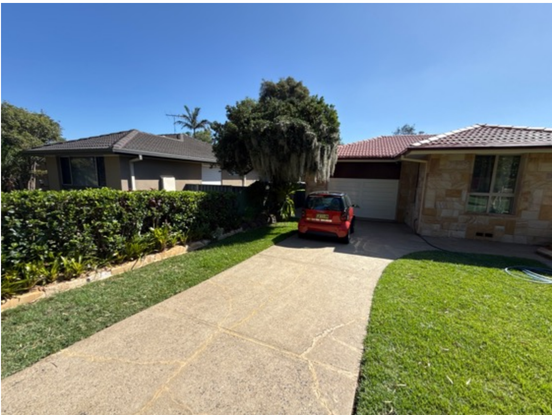
Isolated sections of exterior concrete displays typical shrinkage cracks and undulations - consistent with age.