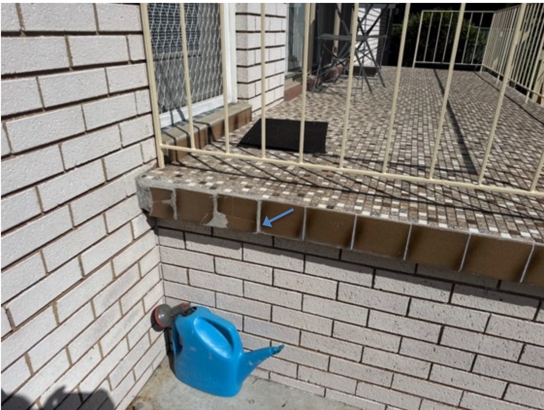
Isolated sections of external tiles are cracked, consistent with age.