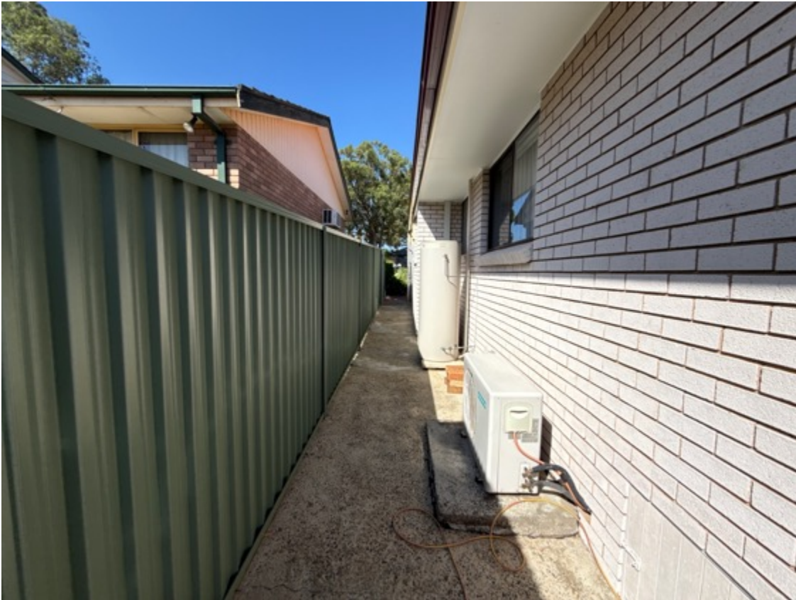
Site fences are in serviceable condition, isolated sections have minor dents - consistent with age.