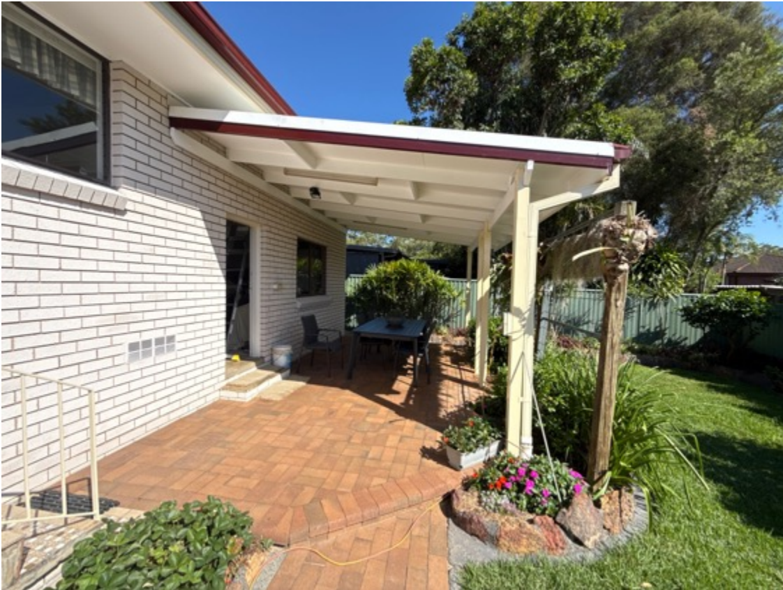
The rear pergola checked is structurally sound - surfaces have recently been repainted.