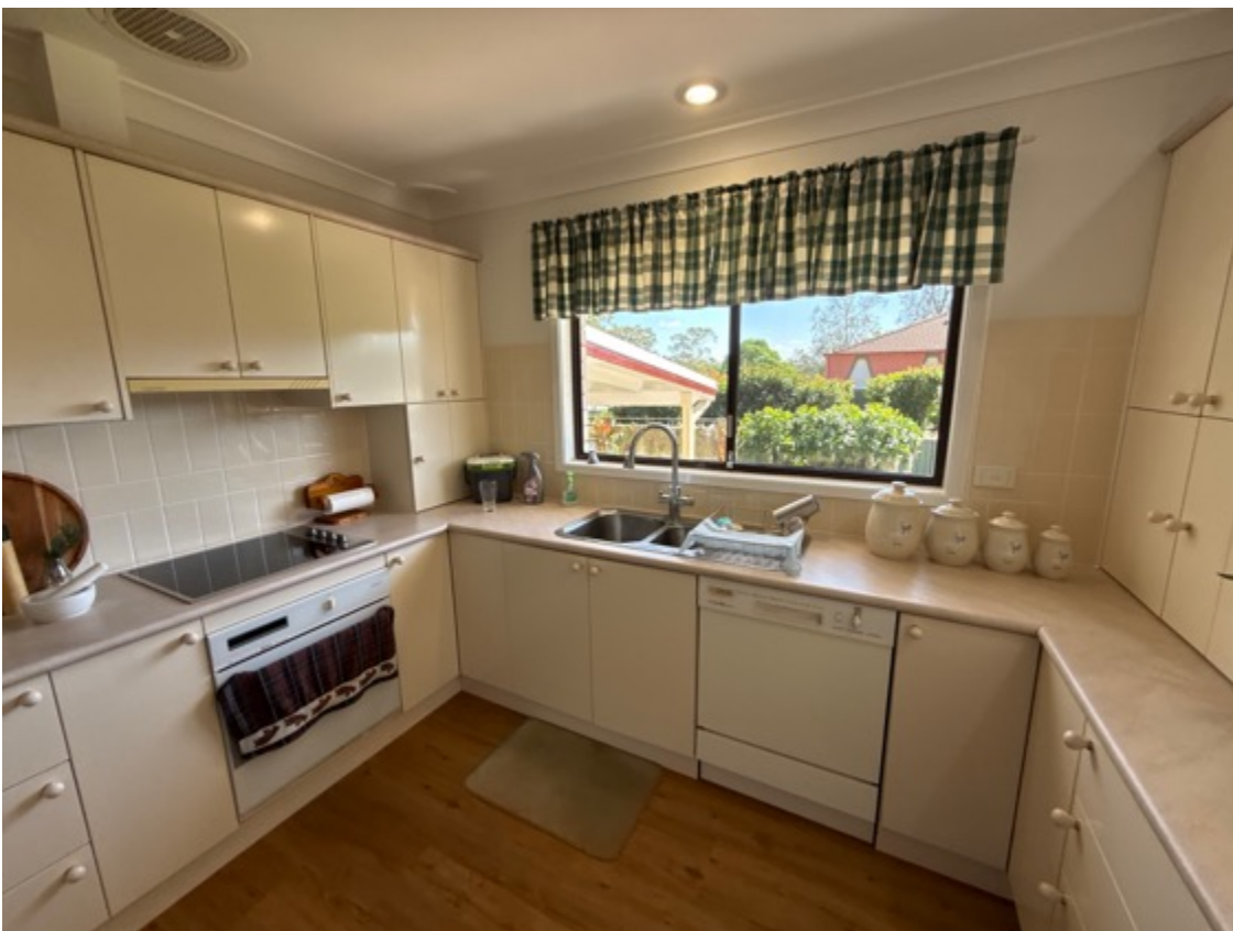
Appliances tested, functioned at the time of inspection.