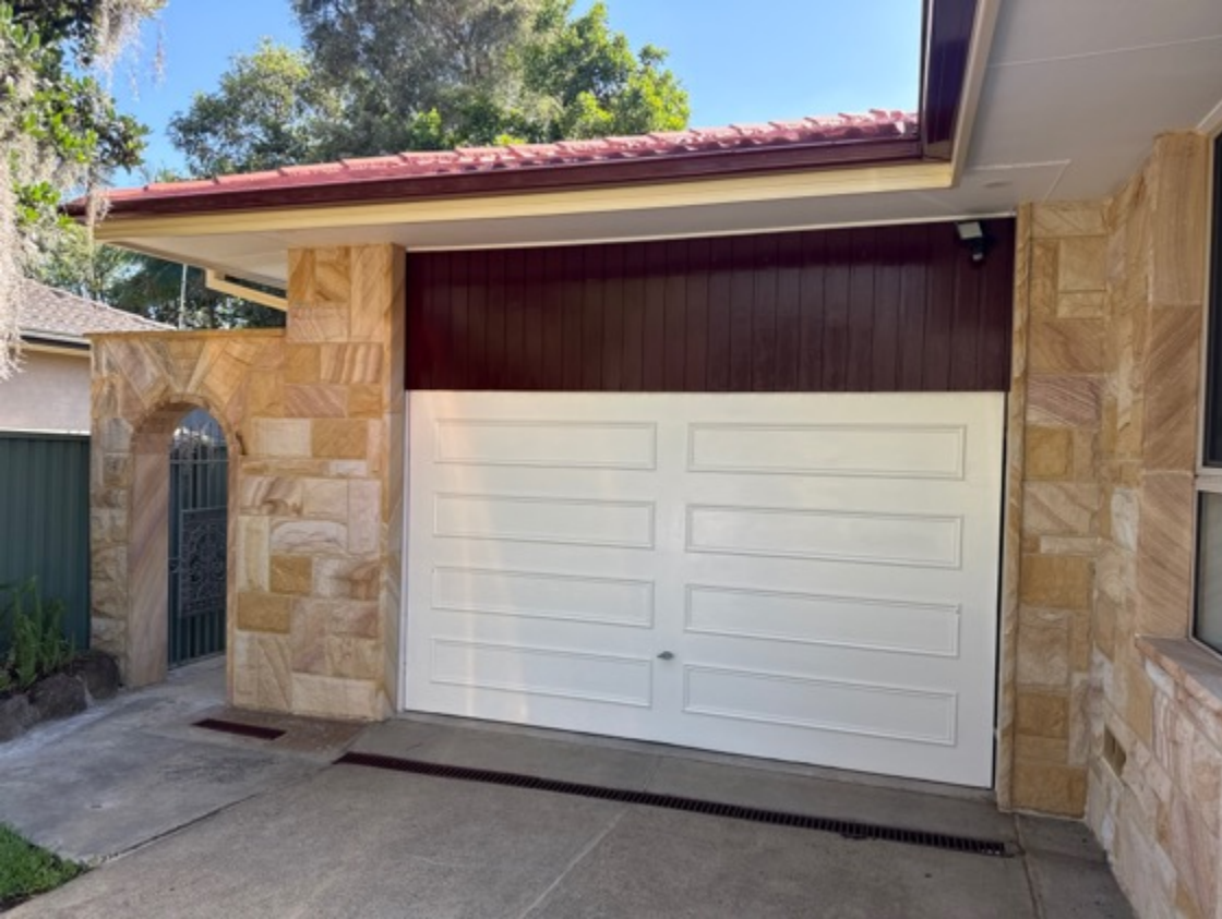
The garage roller door tested, functioned at the time of inspection.