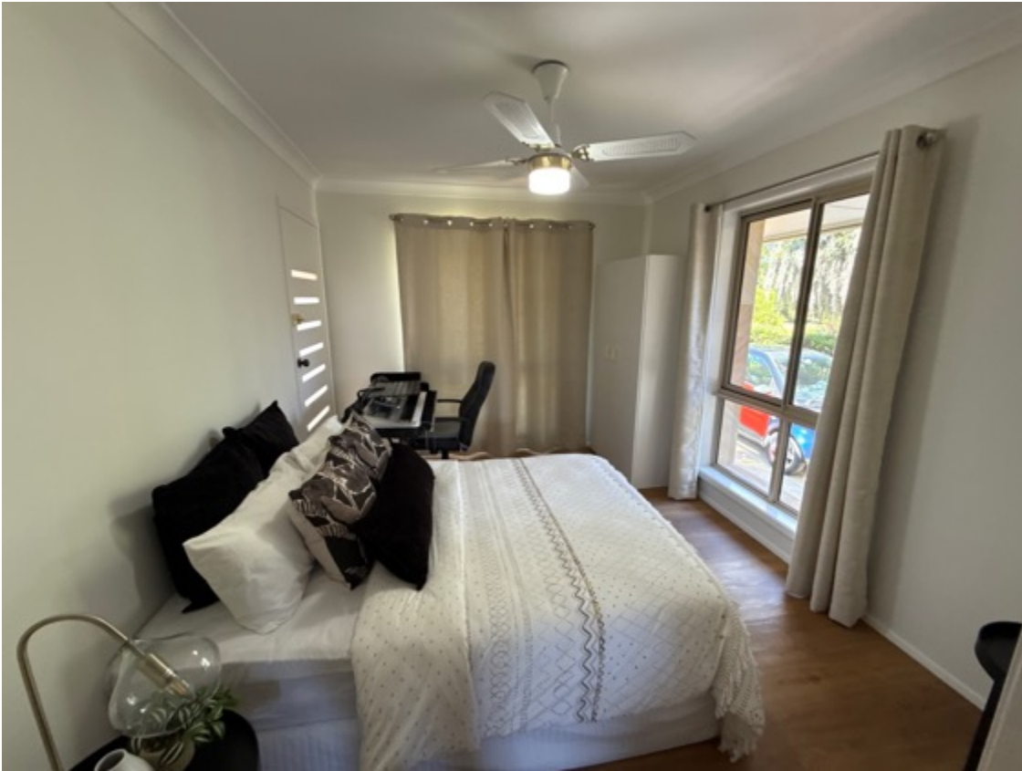
Example front left side bedroom area above.