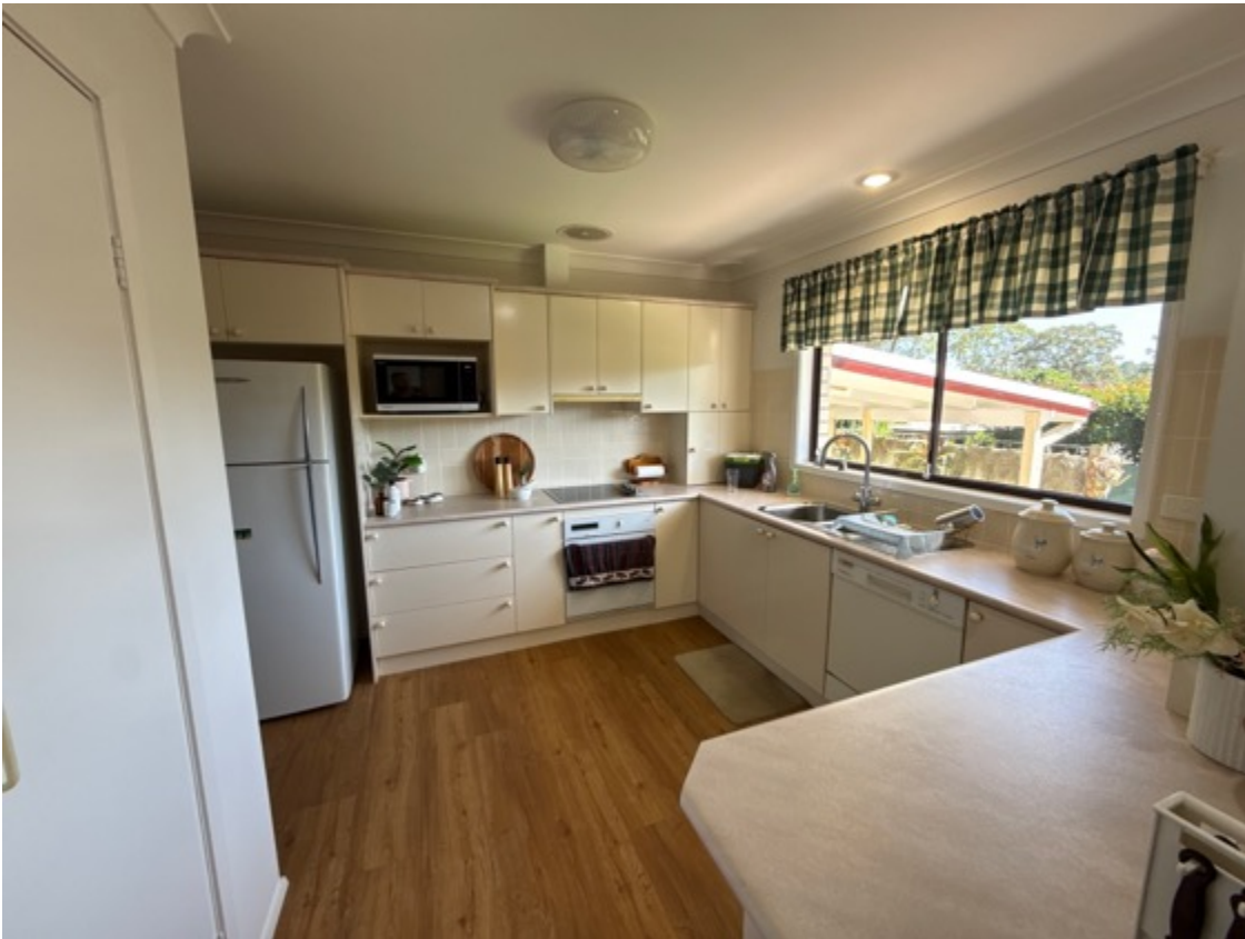
The kitchen area presents in serviceable condition.