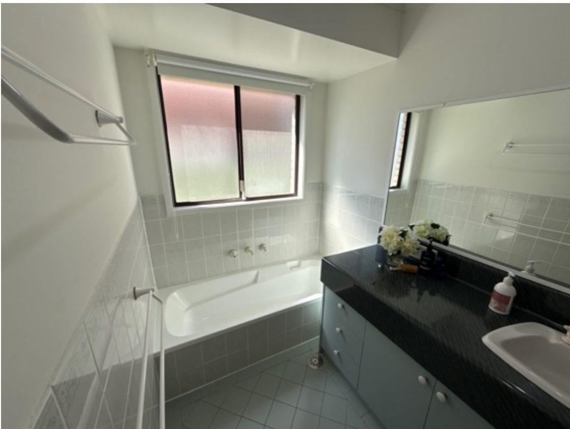
The common bathroom area tested for leaks, fixings and stability was issue free at the time of inspection.