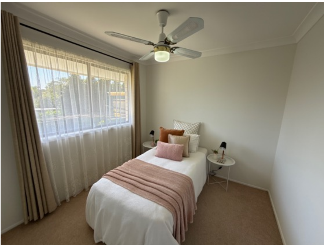
All interior lights tested, functioned as intended at the time of inspection.